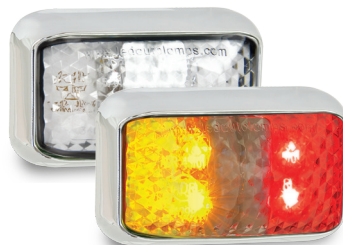
Part Number 35CARM - Blister Single