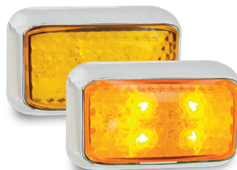
Part Number 35CAM - Blister Single