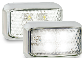
Part Number 35CWM - Blister Single