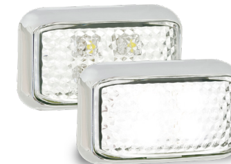
Part Number 35CCWM - Blister Single

ADR Approved 100% Waterproof 5 Year Warranty