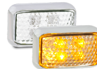
Part Number 35CCAM - Blister Single