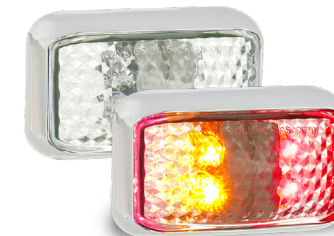
Part Number 35CCARM - Blister Single