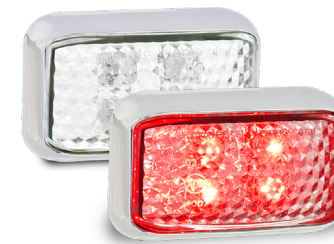
Part Number 35CCRM - Blister Single