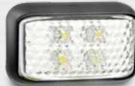
Part Number 35WM - Multivolt 12-24V Blister single