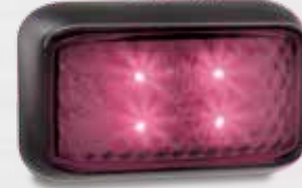
Part Number 35PM - Multivolt 12-24V Blister single