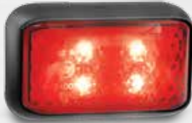
Part Number 35RM - Multivolt 12-24V Blister single