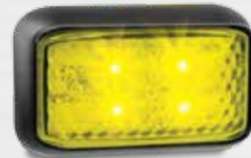
Part Number 35YM - Multivolt 12-24V Blister single