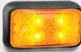
Part Number 35AM - Multivolt 12-24V Blister single