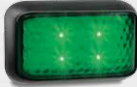
Part Number 35GM - Multivolt 12-24V Blister single