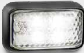
Part Number 35WM - Multivolt 12-24V Blister single