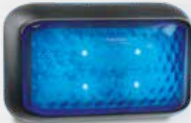
Part Number 35BM - Multivolt 12-24V Blister single