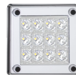
Part No. 280WM