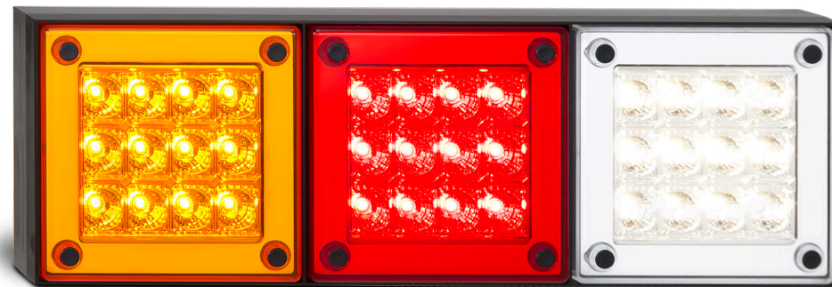
Stop/Tail/Indicator/Reverse 280ARWM - Blister, 12-24 Volt 280ARWMB - Box, 12-24 Volt