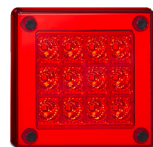
Part No. 280RM