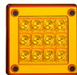
Part No. 280AM