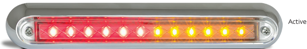
Stop/Tail/Indicator 235CWST112 - Single Bulk