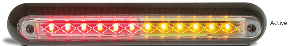
Stop/Tail/Indicator 235BBST112/2 - Twin Blister