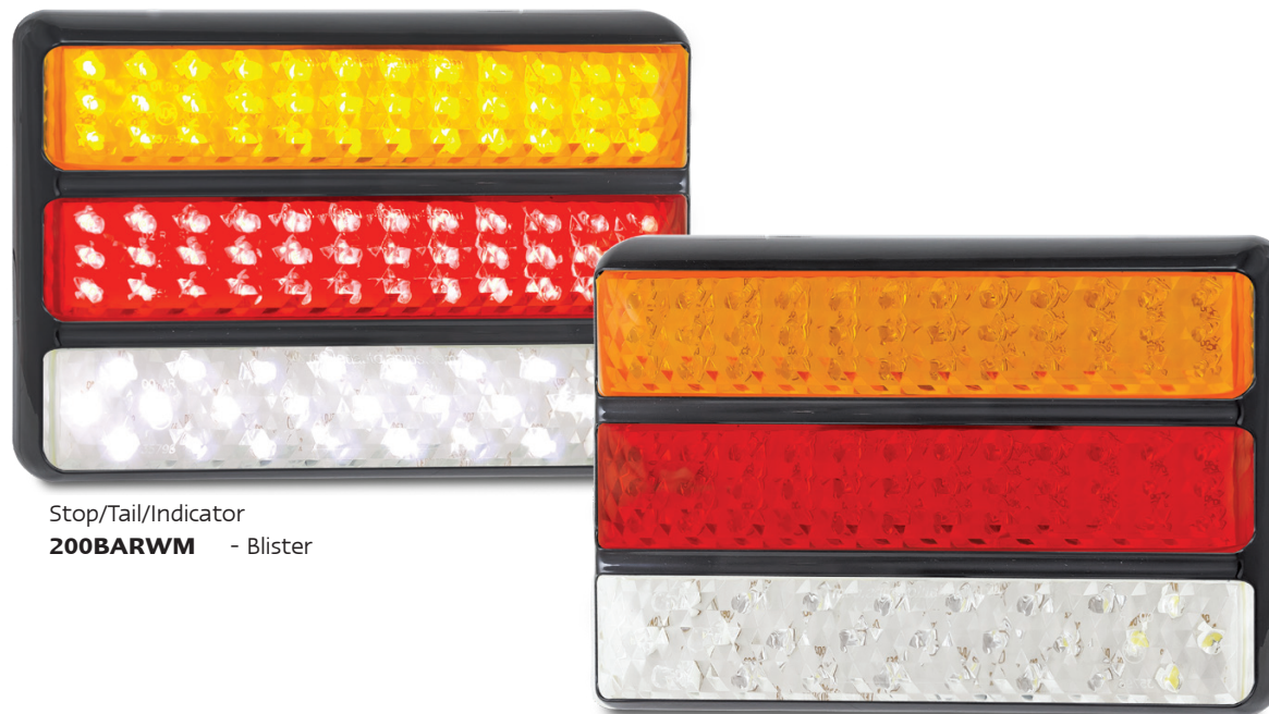
Stop/Tail/Indicator 200BARWM - Blister