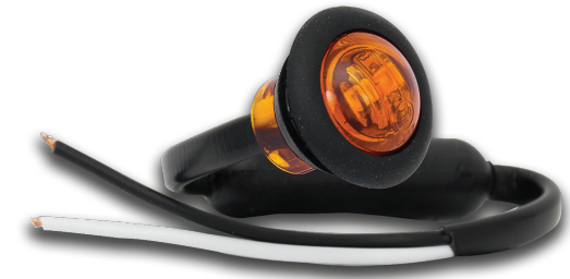
Part Number 181AME - Blister single