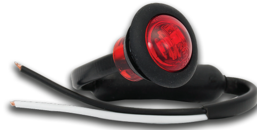
Part Number 181RME - Blister single