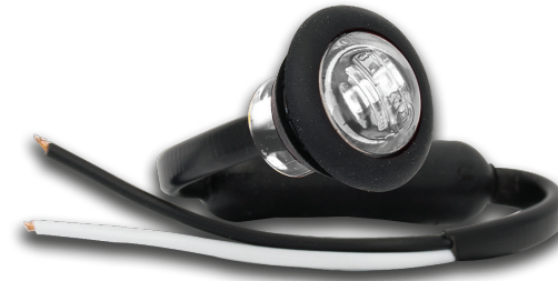
Part Number 181WME - Blister single