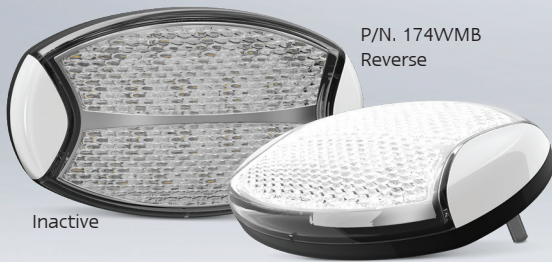
P/N. 174WMB Reverse