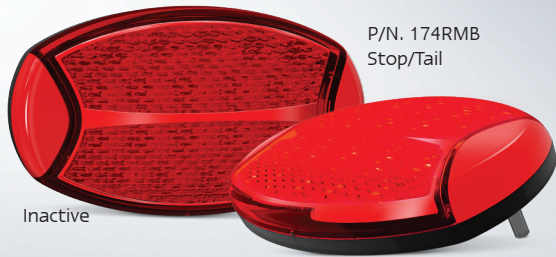
P/N. 174RMB Stop/Tail