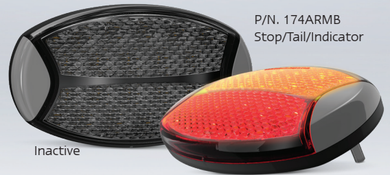
P/N. 174ARB Stop/Tail/Indicator