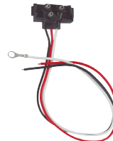
Part No. 53102 Cable Plug