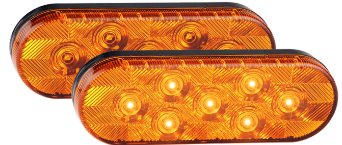
Part Number 164AM - Single Blister