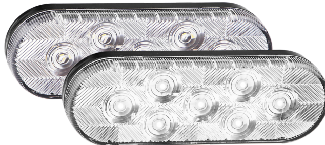
Part Number 164WM - Single Blister