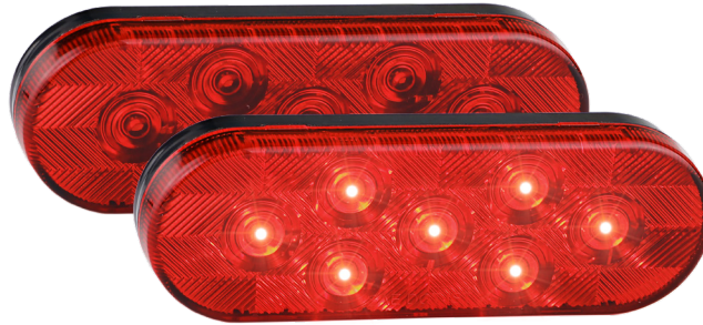
Part Number 164RM - Single Blister