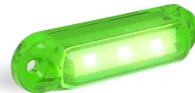
Part No. 16G12-2- 12 Volt, Twin Blister

ECE Approved 100% Waterproof 5 Year Warranty