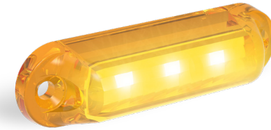
Part No. 16A12-2 - 12 Volt, Twin Blister Part No. 16A24-2 - 24 Volt, Twin Blister