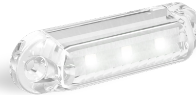
Part No. 16W12-2 - 12 Volt, Twin Blister Part No. 16W24-2 - 24 Volt, Twin Blister