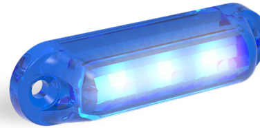
Part No. 16B12-2 - 12 Volt, Twin Blister