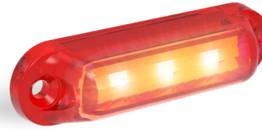
Part No. 16R12-2 - 12 Volt, Twin Blister Part No. 16R24-2 - 24 Volt, Twin Blister