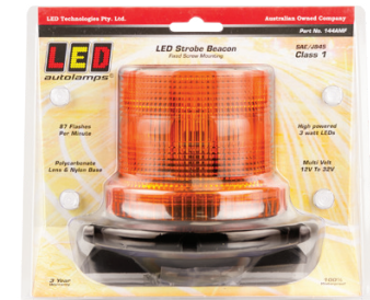
Part No. 144AMF - Blister

Fixed mount - Run cable through hole in mounting surface, fix beacon using bolts supplied