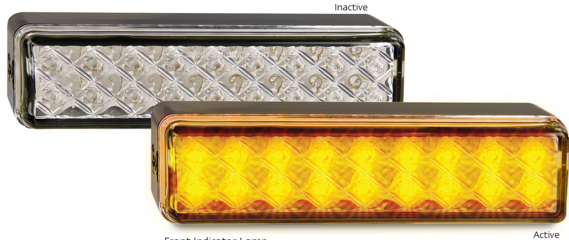
Front Indicator Lamp 135CAT1 - Blister, 12 Volt, Surface Mount 135CAT124 - Blister, 24 Volt, Surface Mount