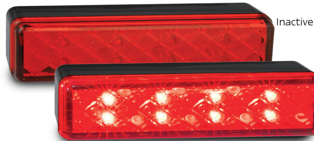
Stop/Tail 135RM - Single Blister