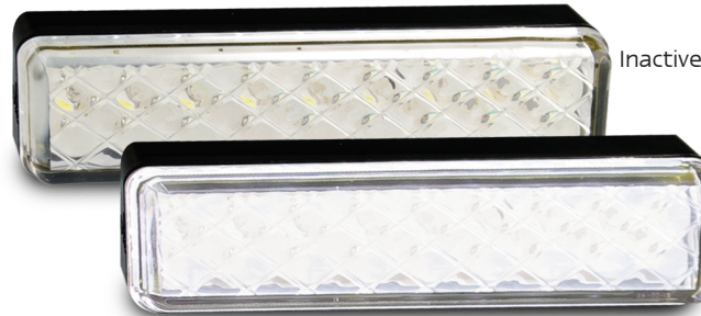
Reverse 135WM - Single Blister