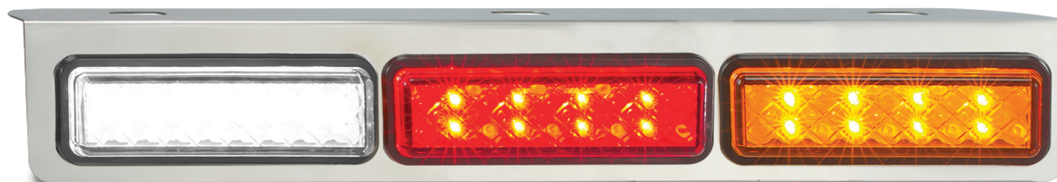
Stop/Tail/Indicator/Reverse/ Reflector 135CARWM2 - Twin Blister, LHS/RHS, 12-24 Volt