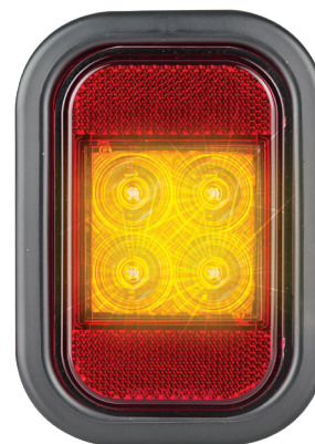
Rear Indicator/Reflector 133AMG - Single Blister