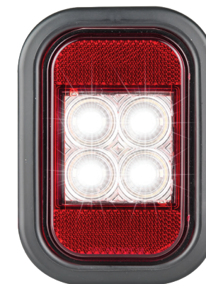
Reverse/Reflector 133WMG - Single Blister