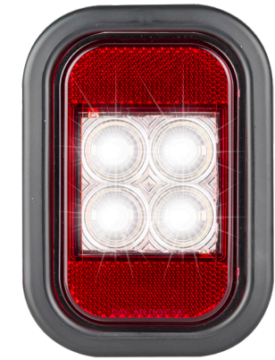
Reverse/Reflector 133WMG - Single Blister