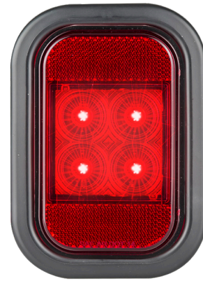
Stop/Tail/Reflector 133RMG - Single Blister