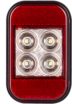
Reverse/Reflector 133WMB - Light Only Bulk