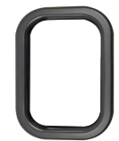
Part No. 59401 Rubber Grommet