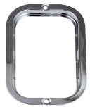
Part No. 59401C Chrome Bkt