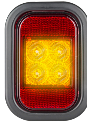
Rear Indicator/Reflector 133AMG - Single Blister