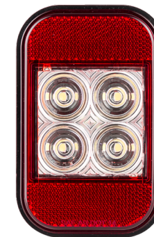
Reverse/Reflector 133WMB - Light Only Bulk