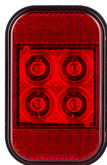
Stop/Tail/Reflector 133RMB - Light Only Bulk