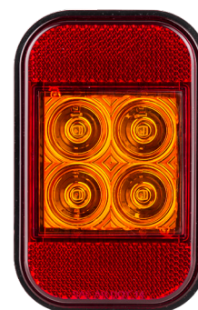
Rear Indicator/Reflector 133AMB - Light Only Bulk