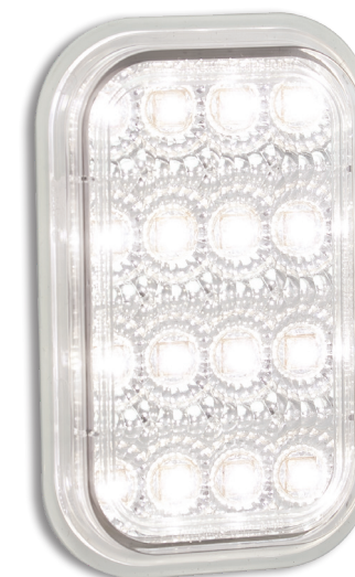
Reverse 131WM - Single Blister