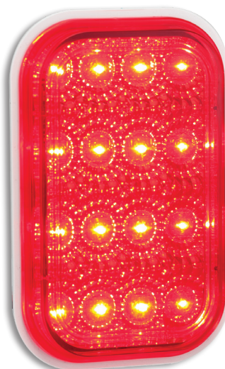
Stop/Tail 131RM - Single Blister