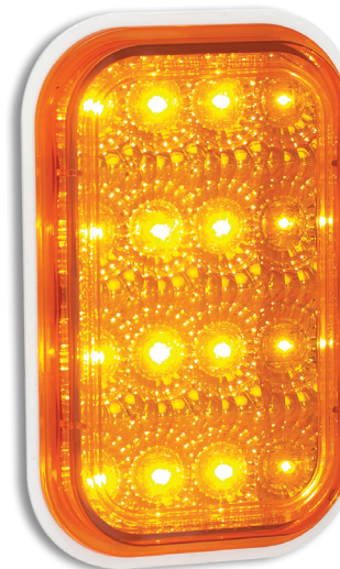
Rear Indicator 131AM - Single Blister