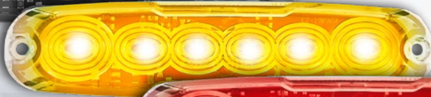
P/N. 12ACM-2 Rear Indicator