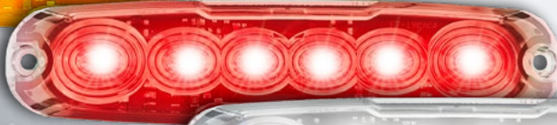
P/N. 12RCM-2 Stop/Tail