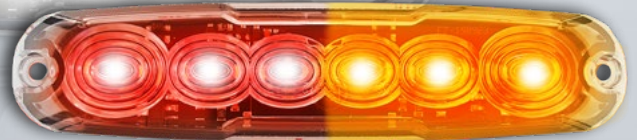
P/N. 12ARM-2 Stop/Tail/Indicator