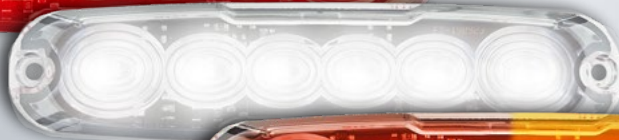
P/N. 12WMM-2 Reverse