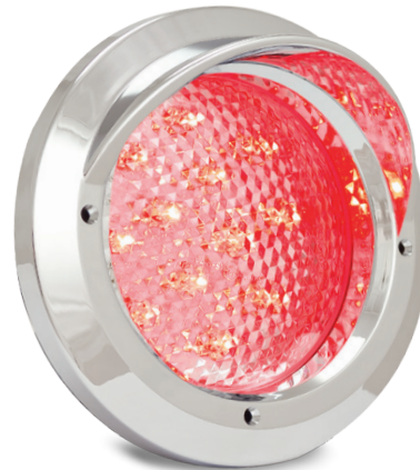
Stop/Tail 110CCRM - Single Blister

Approvals Function Category CRN ADR Stop/Tail 49/00 35299 ADR Indicator 6/00 Cat2a 35298