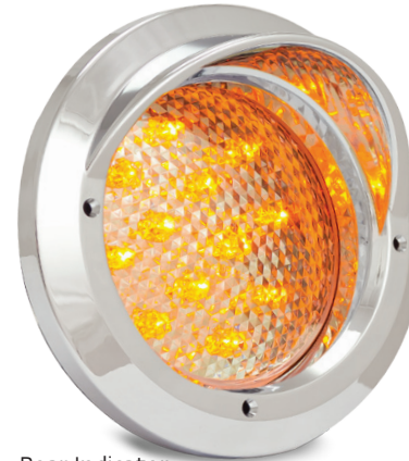
Rear Indicator 110CCAM - Single Blister