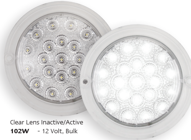
Clear Lens Inactive/Active 102W - 12 Volt, Bulk

ADR Approved IP67 Protection 5 Year Warranty