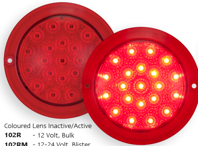
Coloured Lens Inactive/Active 102R - 12 Volt, Bulk 102RM - 12-24 Volt, Blister