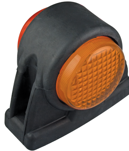
Part Number 1004ARM - Blister Single