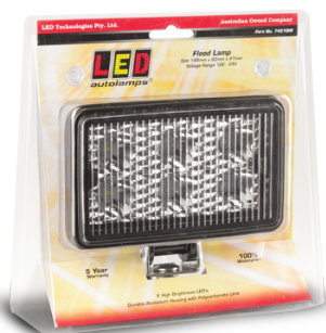
Part No. 7451BM